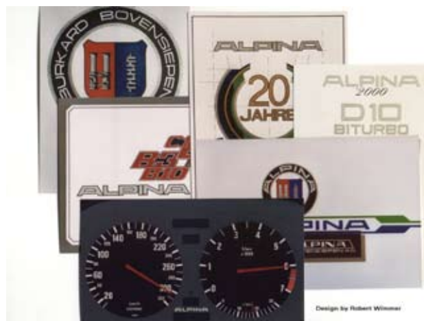
Self-designed birthday cards for the club members

Preparations for 2009 are currently in full swing, anyone who is interested in ALPINA vehicles or who drives one is always more than welcome to join us.