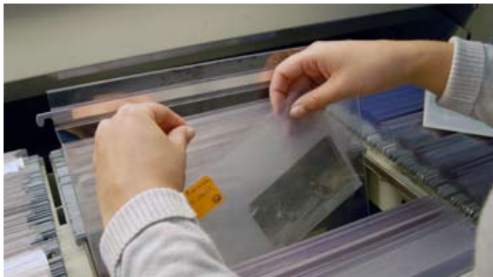
The BMW Group Archive – a customer-oriented service provider

The BMW Group Archive is an integral part of BMW Group Classic. In contrast to many other company archives, however, it not only provides an internal service but is equally open to external customers. This means that members of BMW Clubs can make use of its many services.