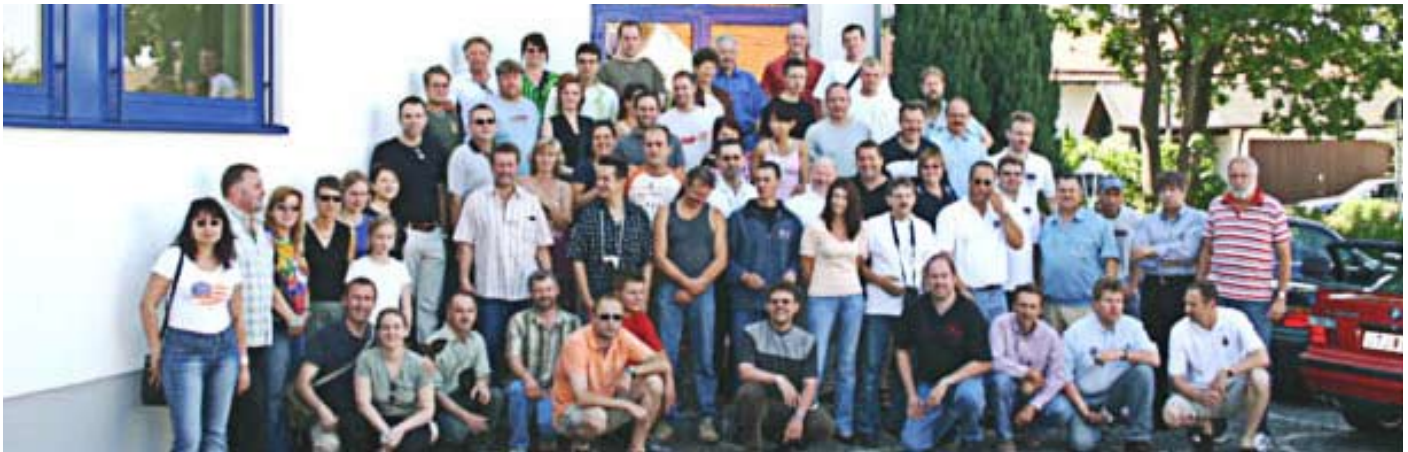
The ALPINA Club is a big family